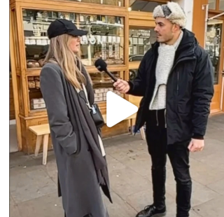
Hoxton Street Style Broadway Market edition