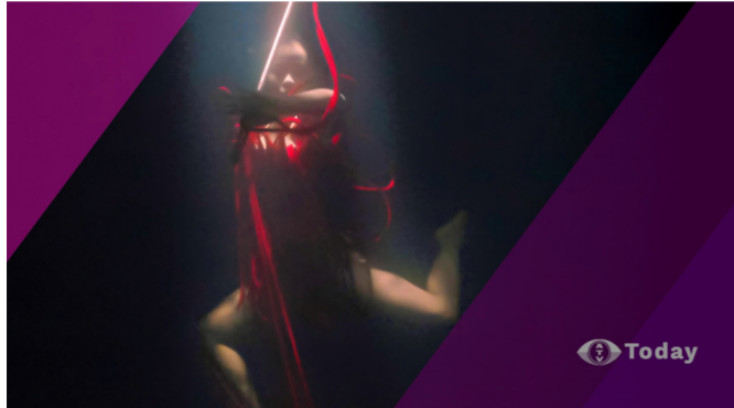
Needle Dance Underwater film still