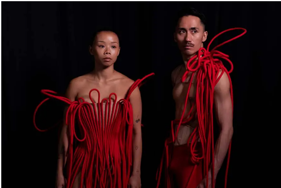
Needle Dance

Art'otel London Hoxton, EC1V ( artotel.com )